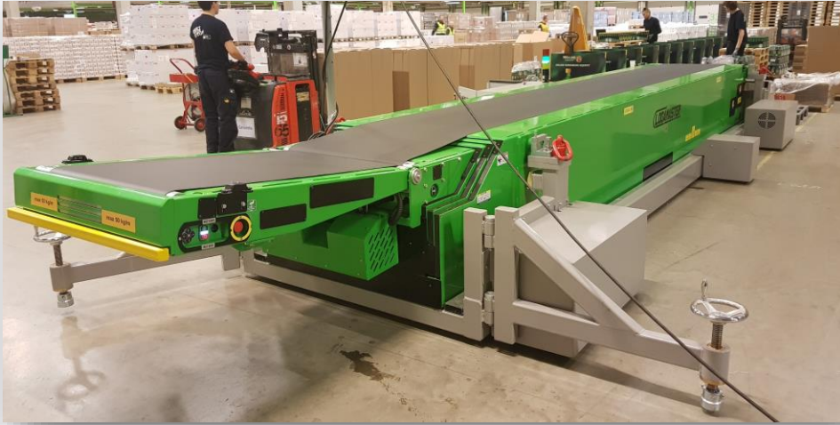
Mobile on Wheels / Rails