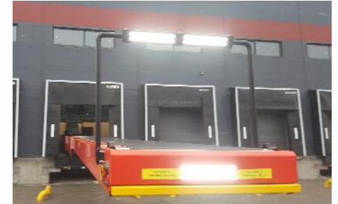
Led Light Bridge