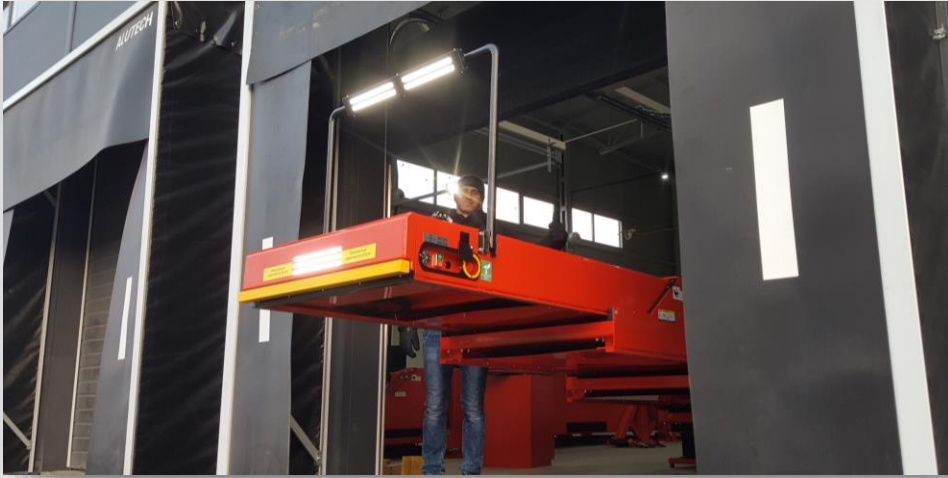
Front Led Bridge