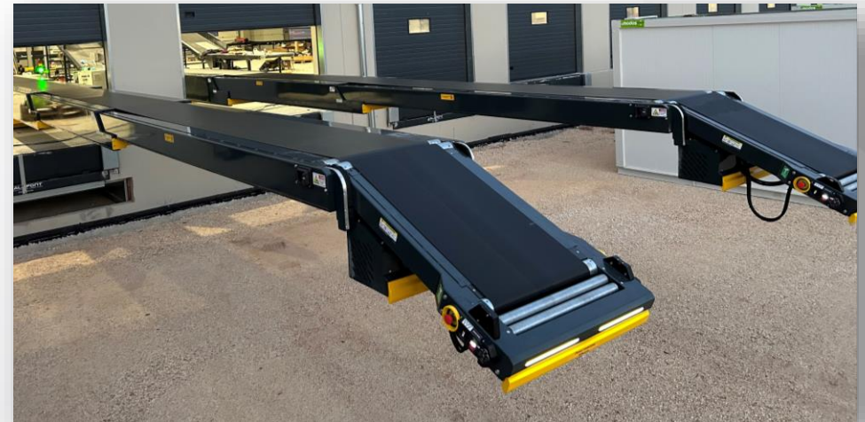
Tilting Front End