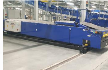
Mobile on Rails