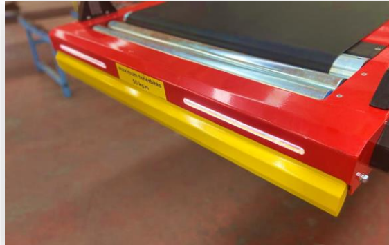
Front Led Light