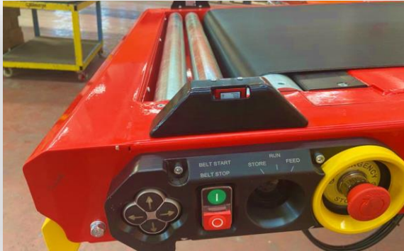
Front Control Panel