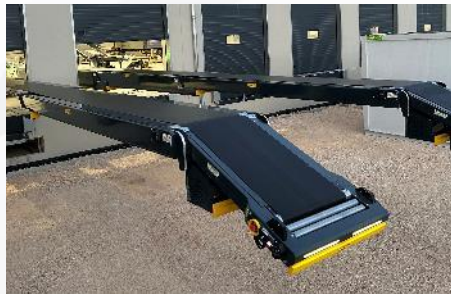
Tilting Front End