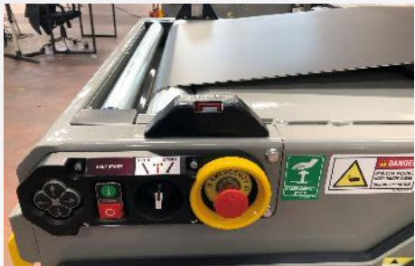
Store Feed Run