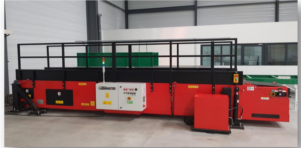
Side Pan / Handrail