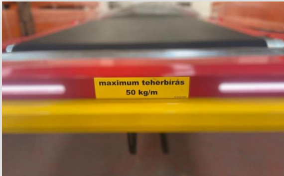
50 kg/m Load Capacity