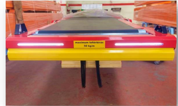
Front Safety Switch