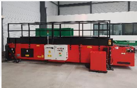
Side Pan/ Hand Rail Kit