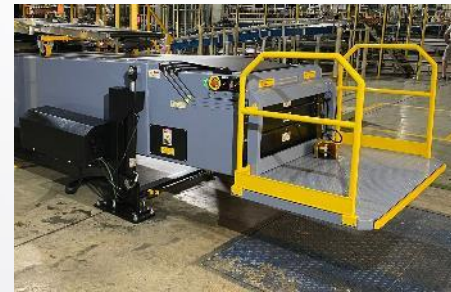
Man rider Platform