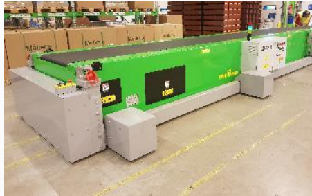
Mobile on Wheels