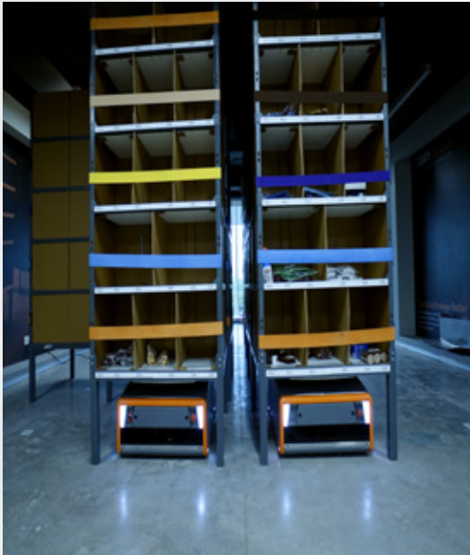
Intelligent robotics for supply chain automation